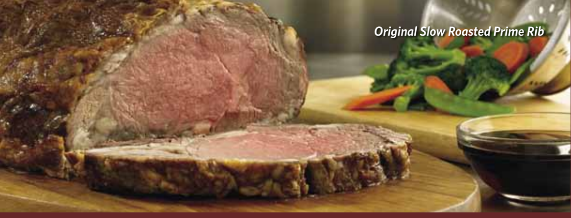
Original Slow Roasted Prime Rib