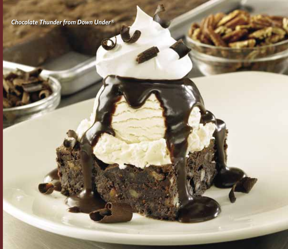
Chocolate Thunder from Down Under®