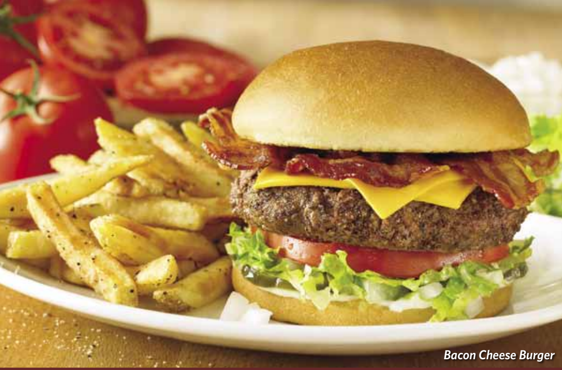
Bacon Cheese Burger