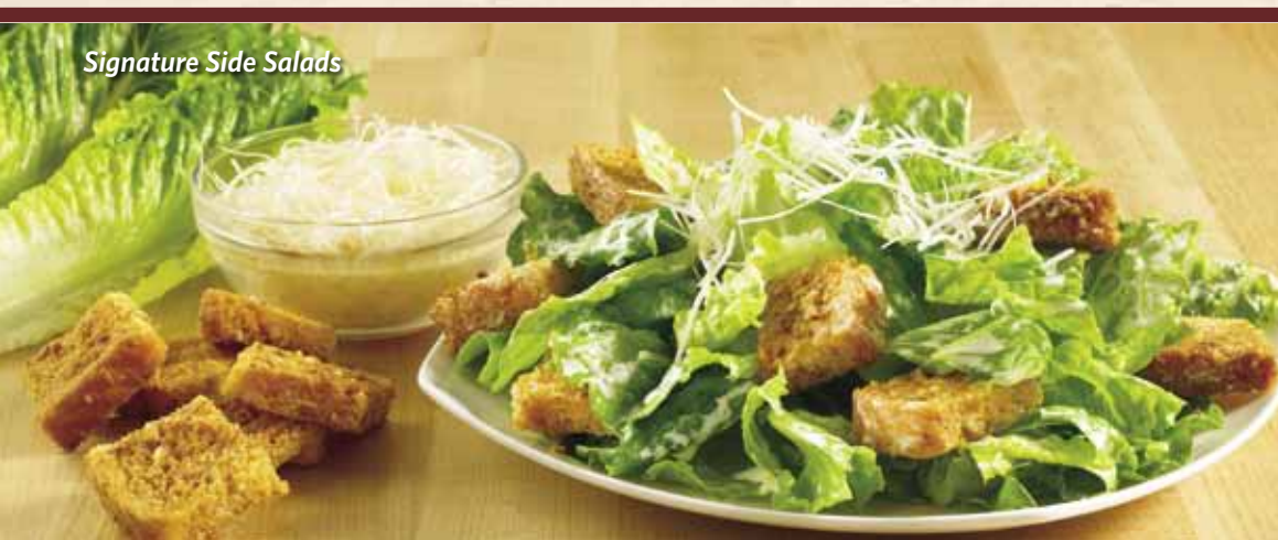
Signature Side Salads

Today's fresh made soup. 今日湯(杯/碗) Cup $80 Bowl $120