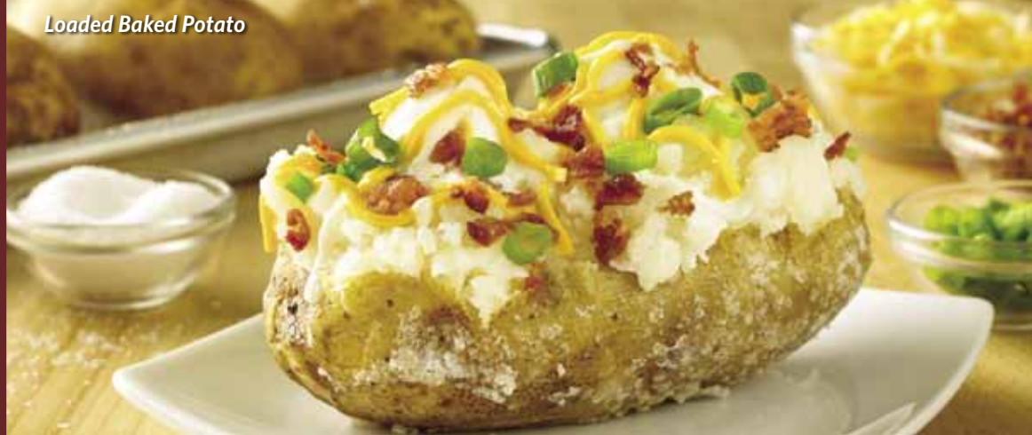
Loaded Baked Potato