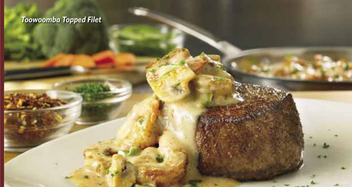
Toowoomba Topped Filet