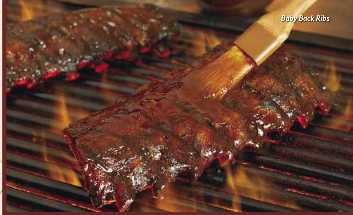
Baby Back Ribs