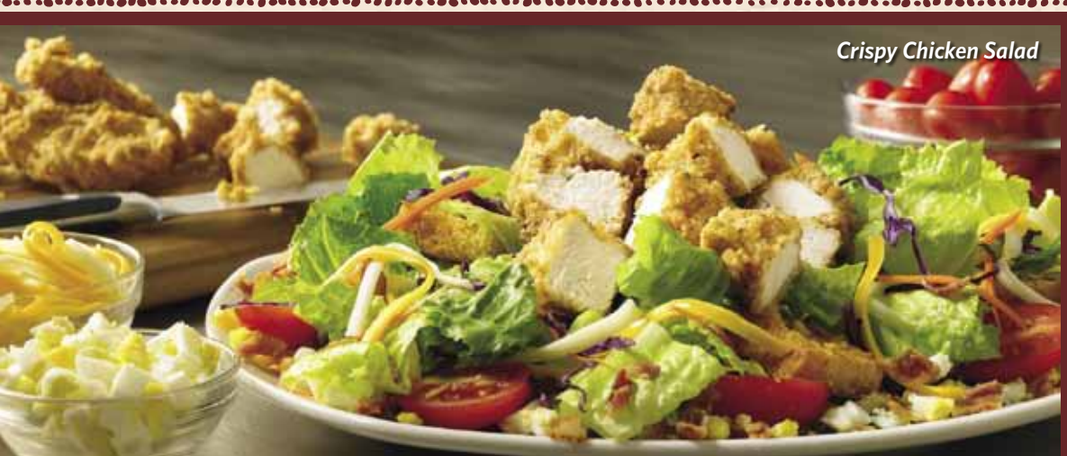
Crispy Chicken Salad

蜂蜜芥末醬 Honey Mustard / 法式鄉村醬 Spicy Ranch 芥末義大利醬 Mustard & Vinaigrette 凱撒醬 Caesar Dressing / 油醋醬 Olive Oli & Vinegar 藍起司醬 Blue Cheese